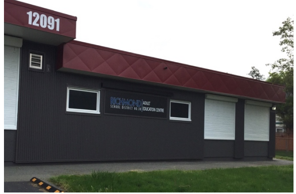
12091 Cambie Road, Richmond

We are here to help you achieve your goals. ☎ 604-668-7899 ⊠ rce@sd38.bc.ca www.richmondce.ca